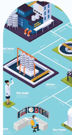
Waste water Engineering