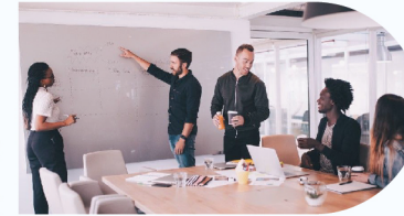
Interaction with Industrial Professionals